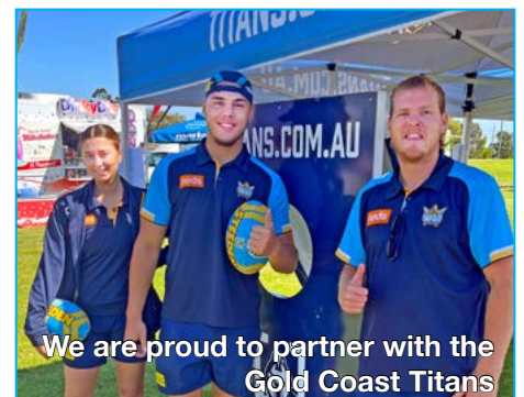
We are proud to partner with the Gold Coast Titans

In short – schools who participated in 2021 need not go through entry requirements and should complete Form A. Schools who are new and or did not participate in 2021 will need to complete Form B. All Interstate and International schools will complete Form A.