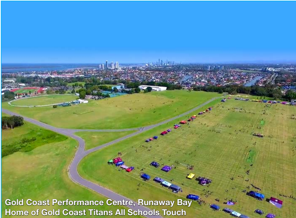
Gold Coast Performance Centre, Runaway Bay Home of Gold Coast Titans All Schools Touch